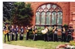
Mariachis serenade the crowd.