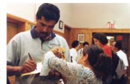
Locals pledge civic participation.