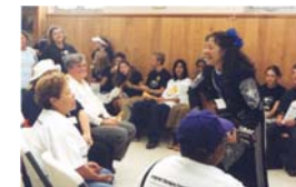
Singing inside the event.