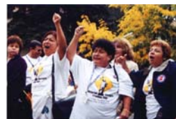
Riders sing songs for freedom.

In Washington, DC the riders met with members of congress, who expressed their support of the ride and the need for immigration reform. Finally, on October 4th, the riders arrived in New York for a rally of more than 100,000 immigrants and their supporters. For more information visit the ride's website at www.iwfr.org , where you can even see a video clip of Flagstaff's event.